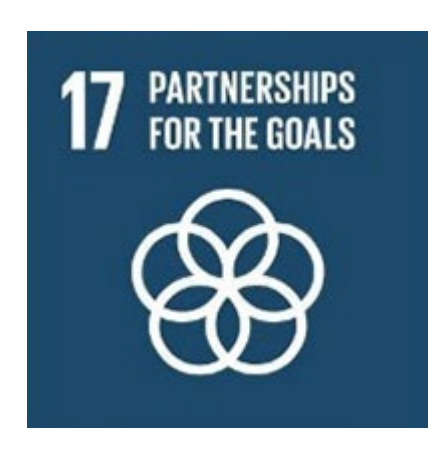
SDG Goal 17 Partnership For The Goals