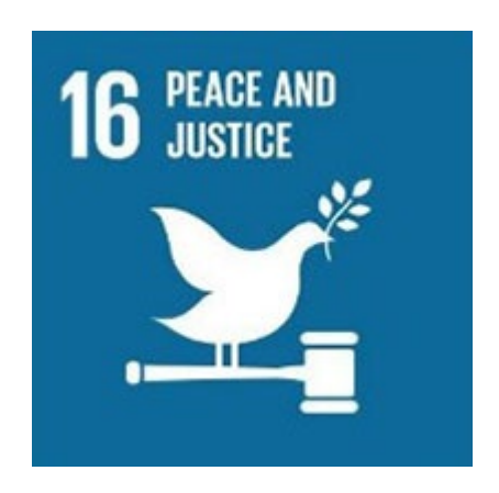
SDG 16 Goal Peace and Justice