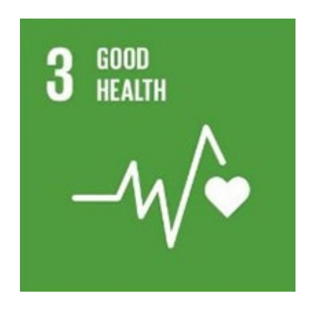
SDG Goal 3 Good Health & wellbeing