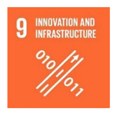
SDG Goal 9 Innovation And Infrastructure