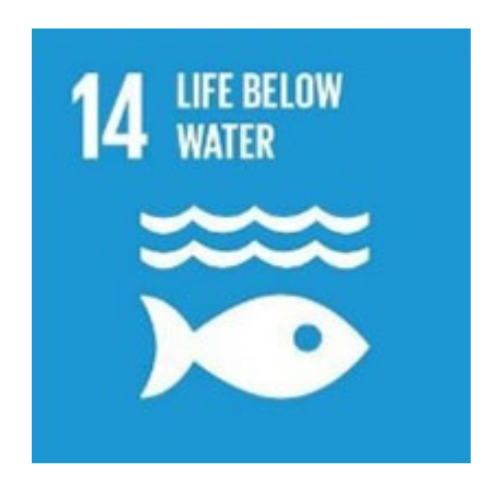
SDG Goal 14 Life Below Water