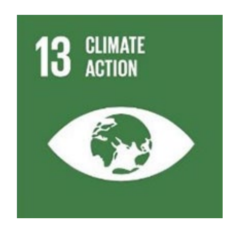
SDG Goal 13 Climate Action