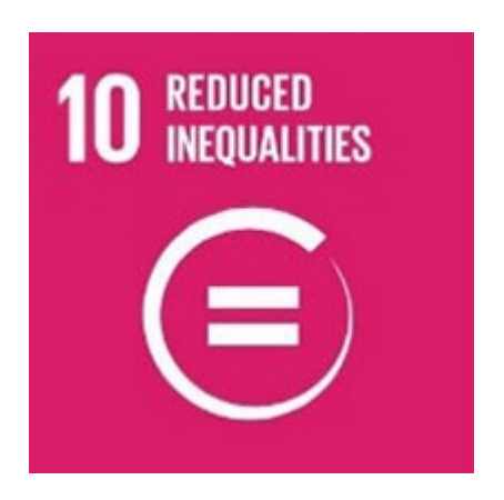
SDG Goal 10 Reduced Inequalities