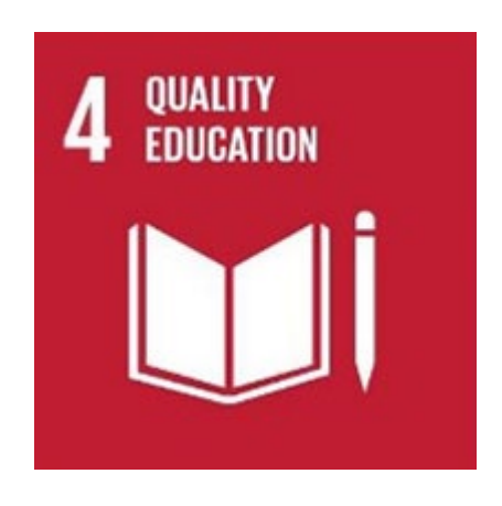
SDG Goal 4 Quality Education