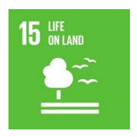
SDG Goal 15 Life On Land