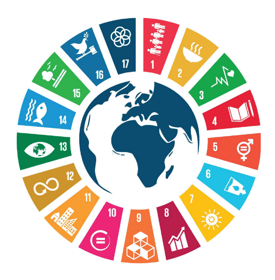
TU Dublin UN Sustainability Goals Progress Report 2023